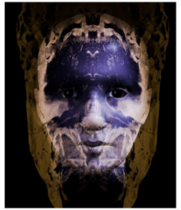
From the series Alchemy