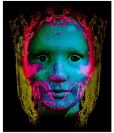
From the series Alchemy