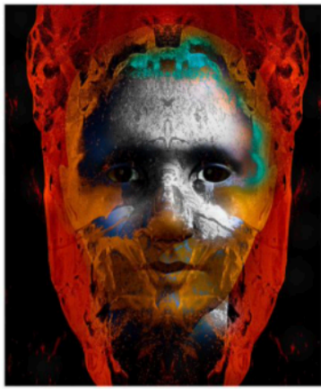
From the series Alchemy