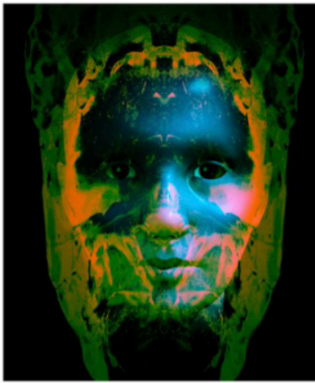
From the series Alchemy